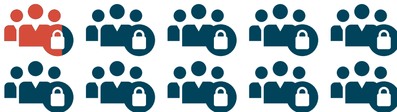
FIGURE 1: PIV STATUS AFTER SEPARATION